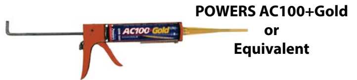
POWERS AC100+Gold or Equivalent