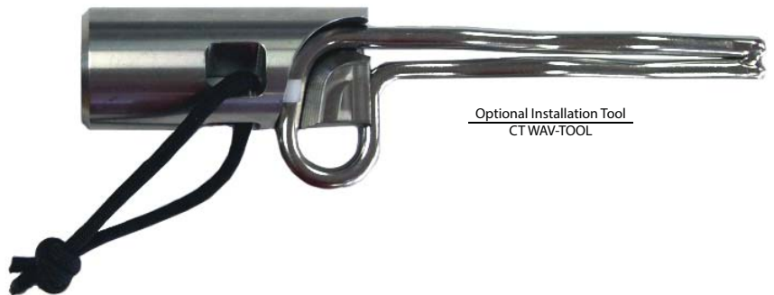
Optional Installation Tool CT WAV-TOOL